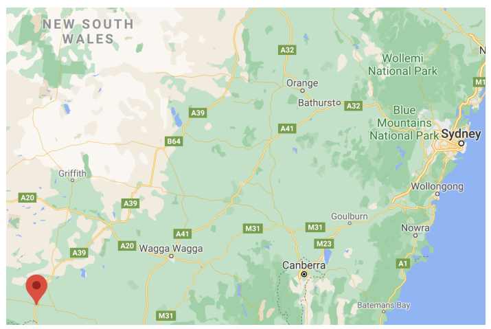
Bathursto as Biue Mountains National Park Sydney Wollongong Wollongong Wollongong Goulburn Nowra Ma3 Canberra A1 Batemans Bay Batemans Bay Blighty Finley Berrigan Roocomoo Baron Baron Batemans Bay Batemans Bay Batemans Bay Batemans Bay Batemans Bay Batemans Bay Batemans Bay Batemans Bay Batemans Bay Batemans Bay Batemans Bay Batemans Bay Batemans Bay Batemans Bay Batemans Bay Batemans Bay Batemans Bay Batemans Bay Batemans Bay Batemans Bay Batemans Bay Batemans Bay Batemans Bay Batemans Bay Batemans Bay Batemans Bay Batemans Bay Batemans Bay Batemans Bay Batemans Bay Batemans Bay Batemans Bay Batemans Bay Batemans Bay Batemans Bay Batemans Bay Batemans Bay Batemans Bay Batemans Bay Batemans Bay Batemans Bay Batemans Bay Batemans Bay Batemans Bay Batemans Bay Batemans Bay Batemans Bay Batemans Bay Batemans Bay Batemans Bay Batemans Bay Batemans Bay Batemans Bay Batemans Bay Batemans Bay Batemans Bay Batemans Bay Batemans Bay Batemans Bay Batemans Bay Batemans Bay Batemans Bay Batemans Bay Batemans Bay Batemans Bay Batemans Bay Batemans Bay Batemans Bay Batemans Bay Batemans Bay Batemans Bay Batemans Bay Batemans Bay Batemans Bay Batemans Bay Batemans Bay Batemans Bay Batemans Bay Batemans Bay Batemans Bay Batemans Bay Batemans Bay Batemans Bay Batemans Bay Batemans Bay Batemans Bay Batemans Bay Batemans Bay Batemans Bay Batemans Bay Batemans Bay Batemans Bay Batemans Bay Batemans Bay Batemans Bay Batemans Bay Batemans Bay Batemans Bay Batemans Bay Batemans Bay Batemans Bay Batemans Bay Batemans Bay Batemans Bay Batemans Bay Batemans Bay Batemans Bay Batemans Bay Batemans Bay Batemans Bay Batemans Bay Batemans Bay Batemans Bay Batemans Bay Batemans Bay Batemans Bay Batemans Bay Batemans Bay Batemans Bay Batemans Bay Batemans Bay Batemans Bay Batemans Bay Batemans Bay Batemans Bay Batemans Bay Batemans Bay Batemans Bay Batemans Bay Batemans Bay Batemans Bay Batemans Bay

In Finley, 70.7% of the population have internet access whilst 25.7% have no connection or unreliable/limited access (ABS, 2020). In COVID times, technology has become increasingly important, and major occasions such as the agricultural event, the Finley show, have been moved online. 90% of parents agreed on laptop access being "an important component of their child's learning" (NSW DoE, 2019, p.21). Access to technology is an ongoing issue in the community and pivotal to the success of students in their studies.